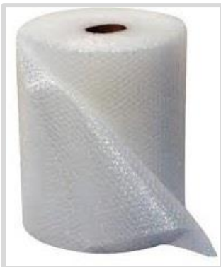
Bubble wrap roll