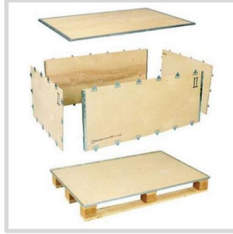
6 pc Nail less wooden box