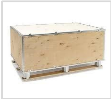
3 pc Nailless wooden box