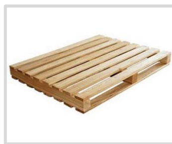
Two - way pallet