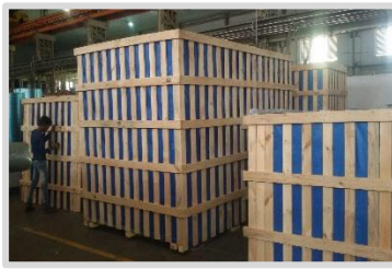
Seaworthy wooden crate