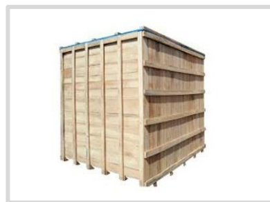
Seaworthy Export wooden box