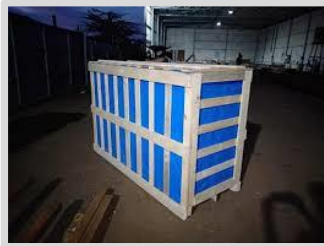
Wooden export packing crate