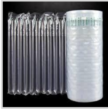
Air Column roll