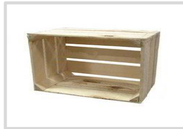
Storage wooden crate