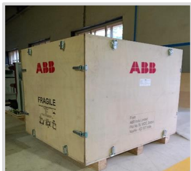
Returnable wooden boxes