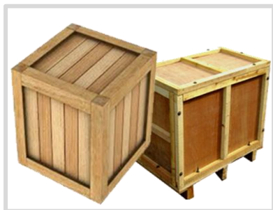
Customizable wooden boxes