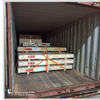
on site pictures after packing